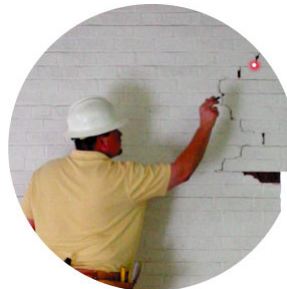
Construction supervisors and inspectors