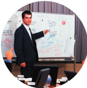
Executives and sales professionals